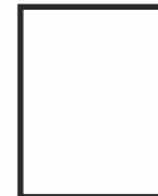
Location Map of Annual General Meeting